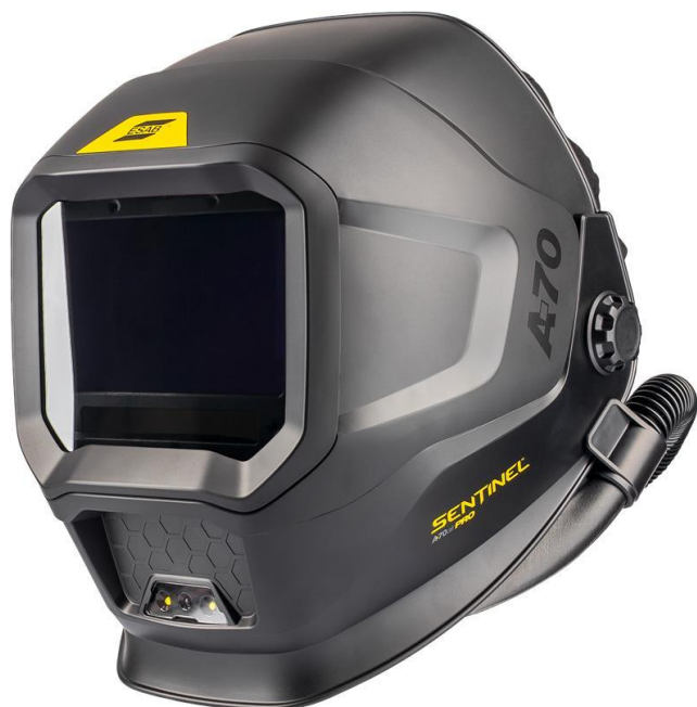
Sentinel A70 Air PRO