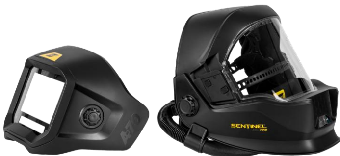
Sentinel A70 Air PRO Removeable ADF