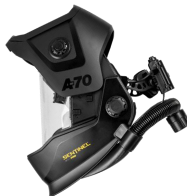
Sentinel A70 Air PRO