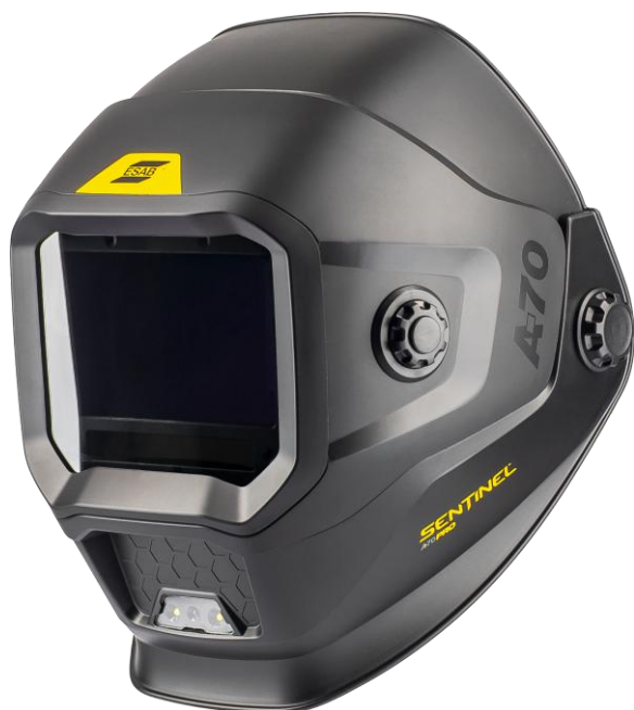
Sentinel A70 PRO