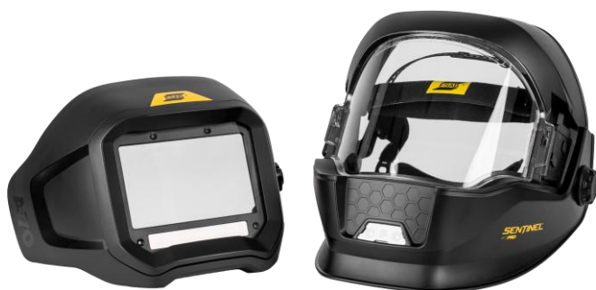
Sentinel A70 PRO Removeable ADF