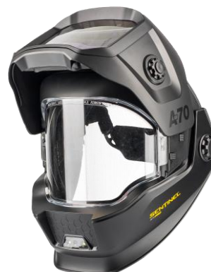
Sentinel A70 PRO